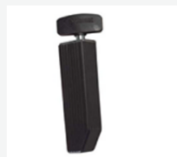
Brake release handle cod. 75160000