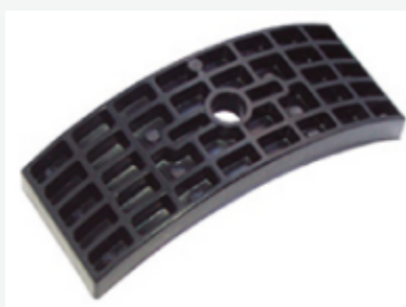
Kit flange adaptor Uniko from Ø 200mm to Ø 220mm cod. 75270000