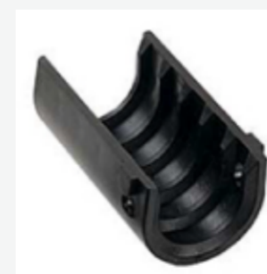
Tube adaptor from Ø 60 mm to Ø 48mm cod. 75260000