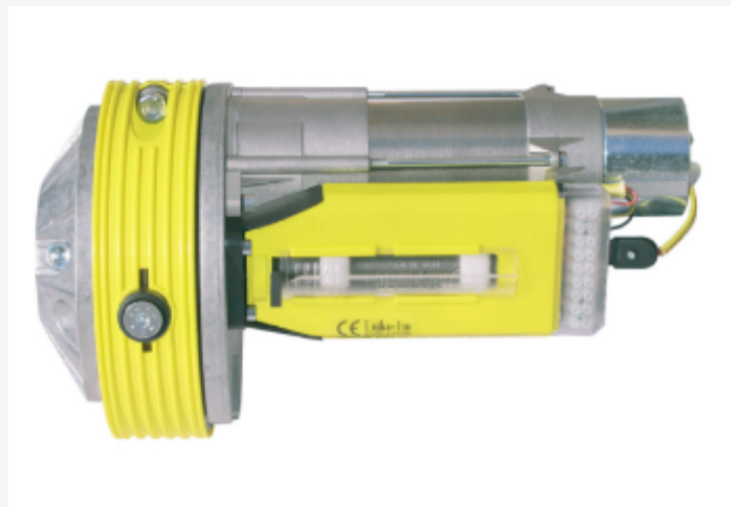
UNIKO - 1M EVOLUTION - cod. 72110000 Single-head central motor for rolling shutters