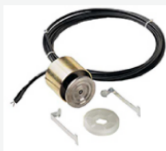
Electromagnetic brake Cable 4 meters cod. 75130000