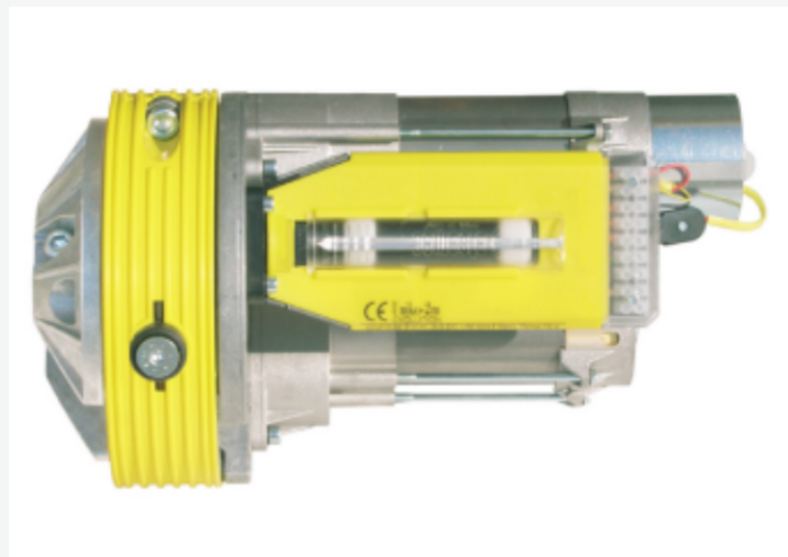
UNIKO - 2M EVOLUTION - cod. 72210000 Double-head central motor for rolling shutters

This series can be defined as a phenomenon of adaptability to all rolling shutters balanced with compensation springs thanks to a continuous improvement of the functional characteristics of the motors and their innovative design. We produce two versions of the motor Uniko: the single-head and the double-head model.